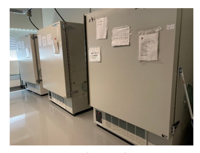
Freezer room at the UC Reading Campus.

A major accomplishment this past year was moving our six -80 C freezers from a location near the University of Cincinnati Medical Center to the University of Cincinnati Reading campus. The Cincinnati Children's Hospital Medical Center freezers and the Hoxworth Blood Center freezers are both at this secure location. Preparations for the move required much effort. The freezers were packed with packing bubble materials. We rented a moving van with electrical power and professional movers. We also purchased a new computer monitoring system for all 6 freezers (SensaphponeWeb 600), which will text and email the research staff if the freezer temperature has increased. The stored blood and urine in these freezers are extremely valuable for future research.